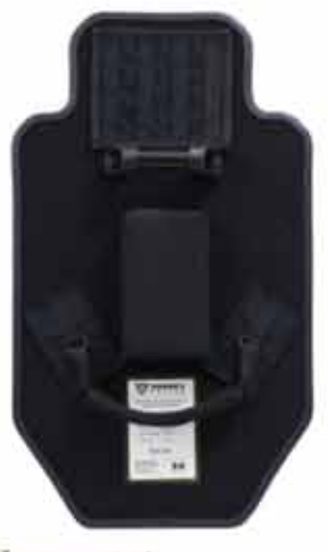
18x30 Medium Juggernaut 26 lbs