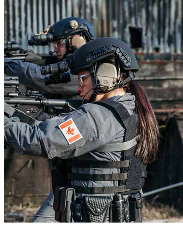
MSRP $1316.32 High Cut Full System