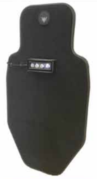
18x36 Large Juggernaut 29 lbs