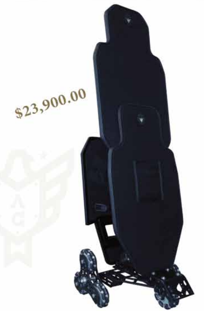
Pictured: 2 Juggernaut Level IV's and a Minotaur Level III ready to deploy